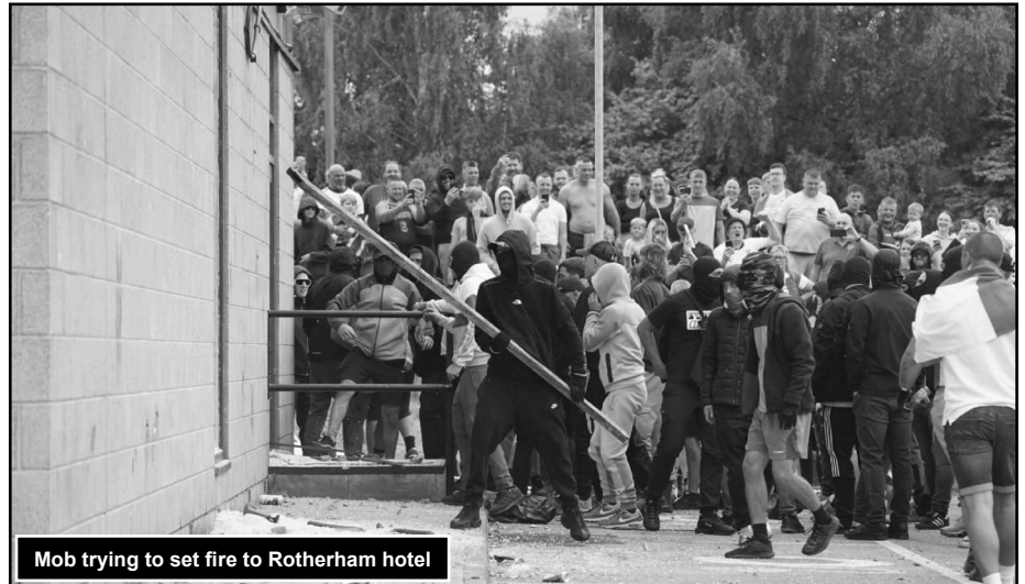
Mob trying to set fire to Rotherham hotel

from the start of their reports of such killing sprees, they made clear that these are invariably the actions of the severely mentally ill, it would go some way to pre-empting lynch mob responses.