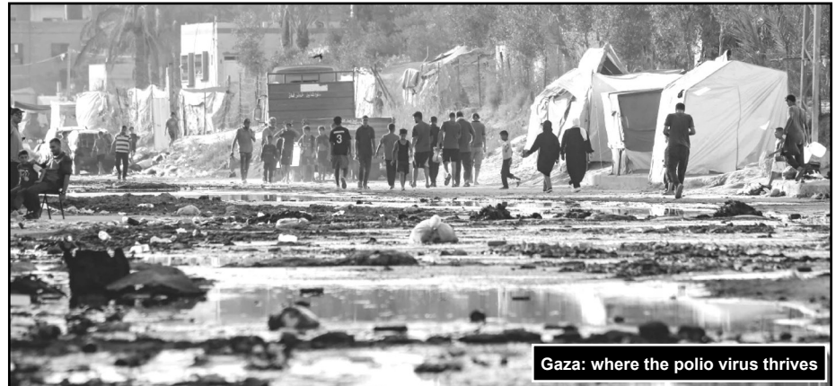
Gaza: where the polio virus thrives

In fact a variant polio virus type 2 was found in 6 out of 7 water samples