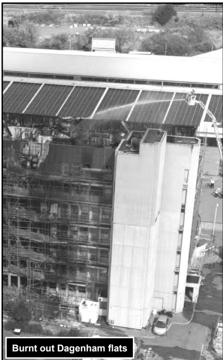
Burnt out Dagenham flats

On the eve of the publication of the final report of the Grenfell enquiry, fire broke out at a 7-storey block of flats in Dagenham. It was having its flammable cladding removed. The fire, which was sparked by equipment on the