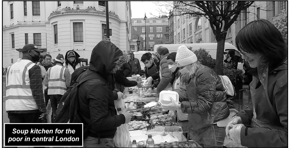
Soup kitchen for the poor in central London

However this is hardly a true reflection of what's going on in the economy from a working class perspective. If instead, "real" GDP is taken as the measure of economic growth - that is, economic output per head of population (GDP per capita) - the British economy has been declining not for 2, but for 8 consecutive quarters! In other words for two years, incomes per person - and therefore household incomes and living standards - have been falling. If "disposable" incomes are taken into account, the situation is even worse - as the underpaid working class knows all too well. In fact on average, real incomes are lower than they were in 2009. In other words, for workers, there has still been no real economic recovery since the 2008-9