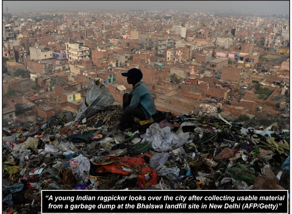
"A young Indian ragpicker looks over the city after collecting usable material from a garbage dump at the Bhalswa landfill site in New Delhi"

Between 2019 and 2024, 50% of the value of electoral bonds went to the BJP, while only 12% went to their main rival, the Indian National Congress. The BJP also received 90% of funds from direct donations and electoral trusts. Soon after companies bought these bonds, they were awarded state contracts, given subsidies and charges for tax evasion and fraud against them were dropped. But companies sometimes fund both the BJP and opposition parties, when the latter hold power in regional states. This ensures they receive state contracts. But it also ensures that the opposition does not raise thorny questions in parliament, regarding the company's activities.