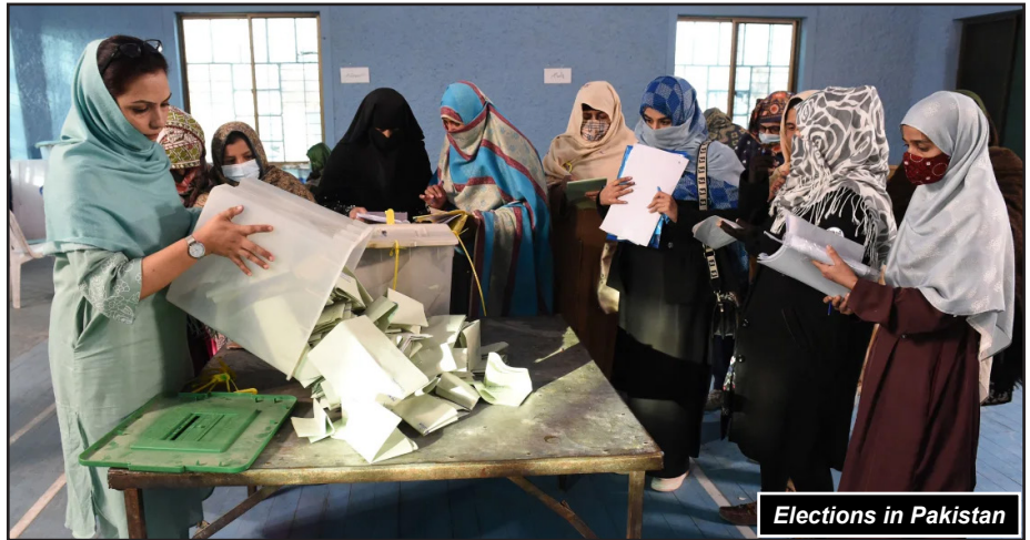
Elections in Pakistan

In August 2023, a military-controlled interim government was appointed to organise Pakistan's elections. In the same month, former PM Imran Khan of the Pakistan Movement for Justice, the PTI, was jailed on multiple charges of corruption to prevent his participation. He'd already been removed from power in 2022 after alleging that the military, together with Washington were plotting to overthrow him - which was probably true. In the run-up to February's election, PTI activists were