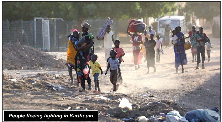
People fleeing fighting in Karthoum

If the Sudanese peoples already had to put up with decades of civil wars post-independence (declared in 1956), it was thanks, precisely, to Britain's "methods" of subjugating the whole Nile region to its control from the 1880s onwards. It instituted "divide and rule" over Sudan jointly with its Egyptian colonial government. It separated off the South, investing in the Arab-Muslim north in order to exploit its rich mineral resources. A local hierarchy was created to do their oppressing for them and "islamisation"