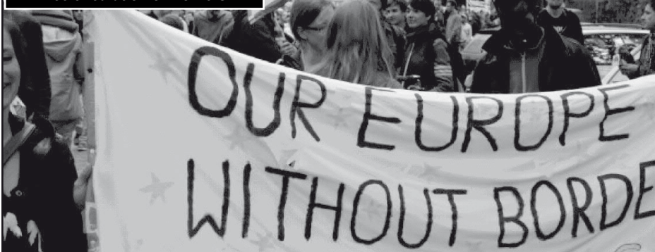
Demonstration in Germany for the free circulation of workers

The truth is that neither the "in" nor "out" vote, will offer a way for workers to defend their interests. But, out of respect for this so-called "democratic" system, Corbyn won't expose this fact. Instead, he prefers to ask workers to vote "yes" - and, therefore, to endorse the very same attacks on their migrant brothers and sisters that Corbyn himself, has denounced!