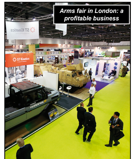
Arms fair in London: a profitable business

Nevertheless the OECD managed to justify this change by claiming its aim was to "address the root causes of conflicts, forced displacements and refugee flows". As if pouring weapons into the poor countries while looting their inadequate resources and pushing them further into poverty weren't the root causes of conflicts across the world!