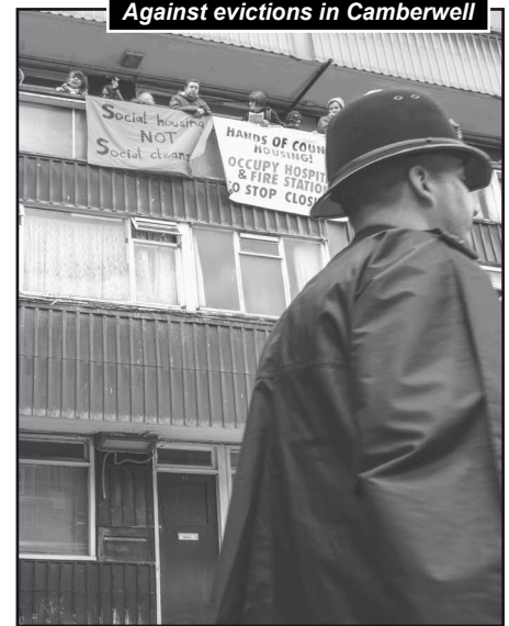
Against evictions in Camberwell

Liverpool One, a 34-street shopping centre in Liverpool, owned by the Duke of Westminster's Grosvenor estate. It is part of the city centre and caters for well-off shoppers who can park underground and not venture outside its bounds all day. For Liverpool's working-class population the shops would be prohibitively expensive; likewise its cafes, which are the only places to meet or rest. Corporations allowed to control new environments like this will create islands of affluence until, as in many poor countries, formally excluding the poor with members-only spaces becomes a next logical step.