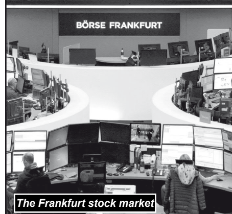
The Frankfurt stock market