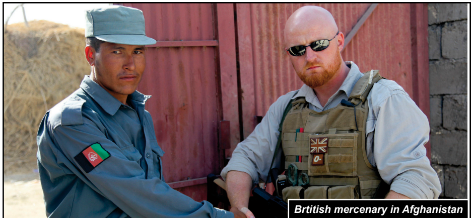
British mercenary in Afghanistan

The British government's favourite "outsourcing partner", G4S, is the world's largest such company. Last year G4S secured a £188m-contract to provide "security" for the Basra Gas Company, in Iraq. In Africa, where G4S has a £500m turnover,