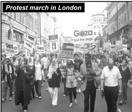
Protest march in London

The Israeli army's bloody raid against a humanitarian flotilla heading for Gaza is another illustration of its terrorist