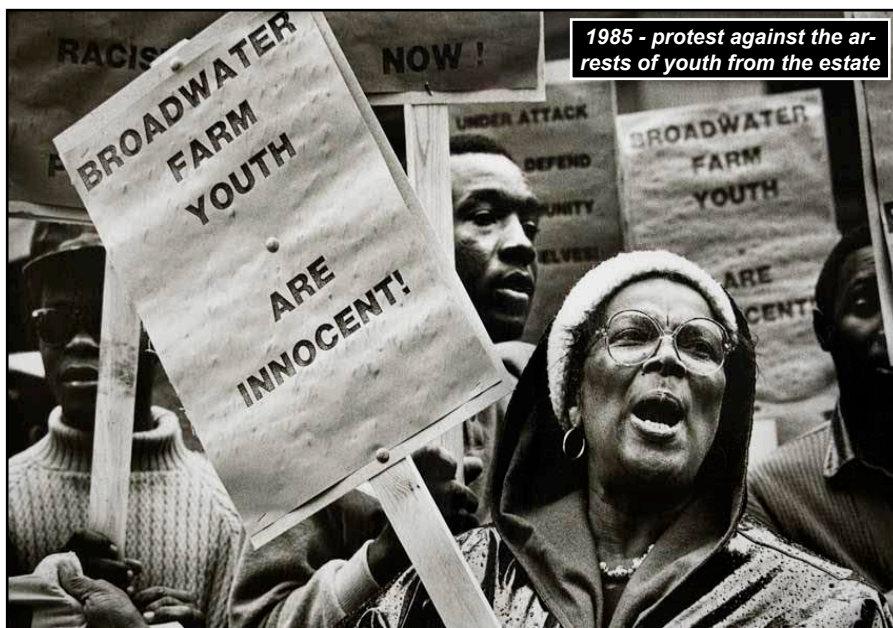
1985 - protest against the arrests of youth from the estate

In the 1980s, social dereliction was increasing, particularly high youth unemployment, while jobs were being brutally slashed and the welfare state was being rolled back. Thatcher's answer to protest and resistance was the "iron fist" of police repression - whether against the striking miners or the inner city youth. Saturation policing and "stopping and searching" black youth was meant to keep them in line. But cops often overdid it. In 1985 in Tottenham, they raided the home of a local youth worker, causing his mother